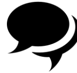
Messenger for biz